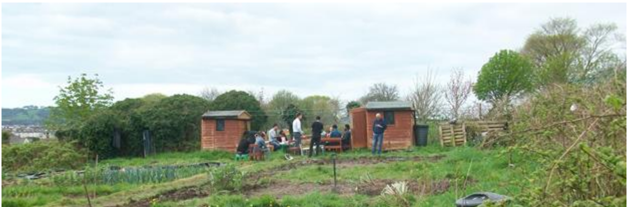
Allotment lunch - 2014

A combination of optimism, imagination, a tiny amount of seed funding from START, immense amounts of goodwill and sheer serendipity have produced a fine, self-sustaining model of intercultural understanding and harmony!