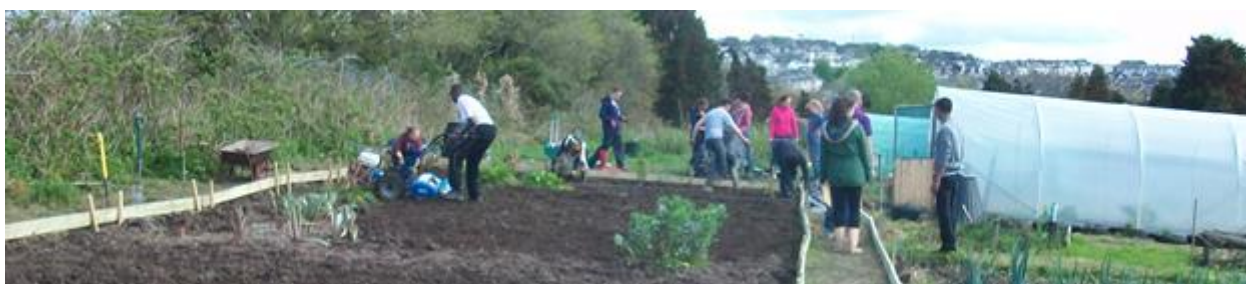
Allotment digging day – April 2014

We are skilled at offering a variety of ways for refugees to access information and advice that strengthens their independence, builds their confidence and resilience, promotes understanding of processes, enables integration and aids successful resettlement.