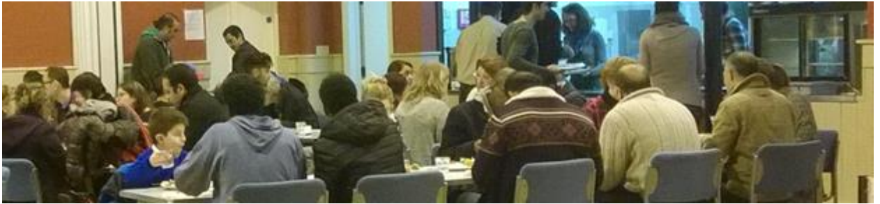
Sharing time together – Cultural Kitchen - 2014

Table Tennis Group: A small group of refugees befriended each other at the Cultural kitchen and enjoyed playing table tennis together. It became part of their adopted culture and, improbably began to travel by train to the Cornish village of Calstock to play with local people once a month.