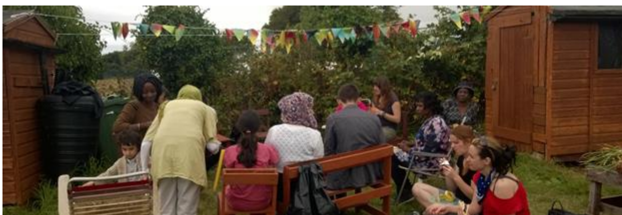
Allotment planting day – summer 2014

“There were some challenges I encountered at START to do with the communication difficulties of clients as they didn’t speak much English. However this was quickly addressed by the willingness of some service users who helped to translate.”