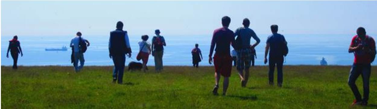
START walk: Cremyl to Cawsand/Kingsand - April 2014

START's work is to enable refugees to settle successfully in the city and begin their new lives with access to all the practical resources and wider support that they need. Our innovative work model remains relevant and fresh. It utilises the resilience of refugees together with the skills and strengths of students supported by professional expertise. This creates a high quality service and provides exciting and challenging placements for professional learners.