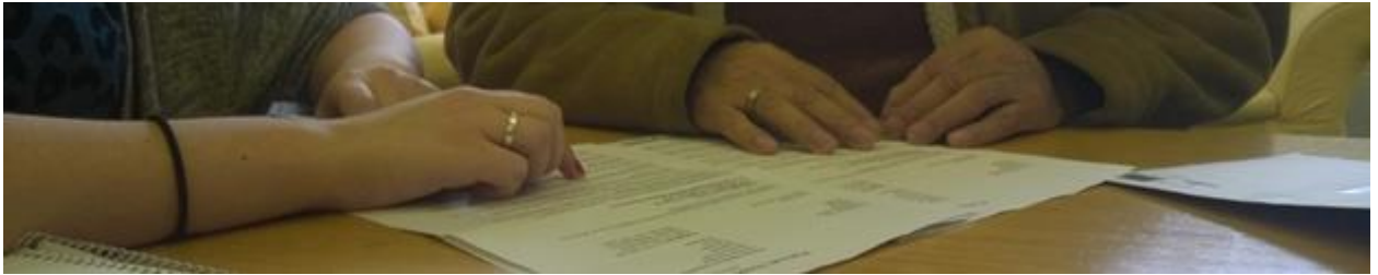
One to one support - 2014

In the past year, 140 refugees have accessed one-off support. The issues brought range from water and utilities bills, annual benefit changes, booking driving lessons, changing benefit circumstances due to finding work, booking travel tickets, creating an email address etc. In the majority of cases the issues are resolved within two or three sessions.