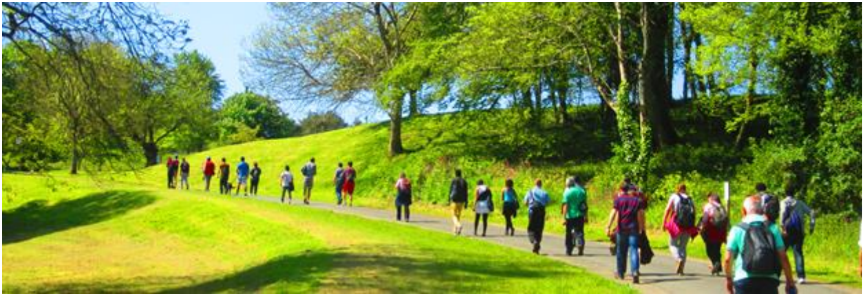
START walk - May 2014

In addition, START has consistently attracted additional funding that enable additional services that add value and depth to the RHSS service. The RHSS delivered 112% against targets during the year...with no extra cost to the city.