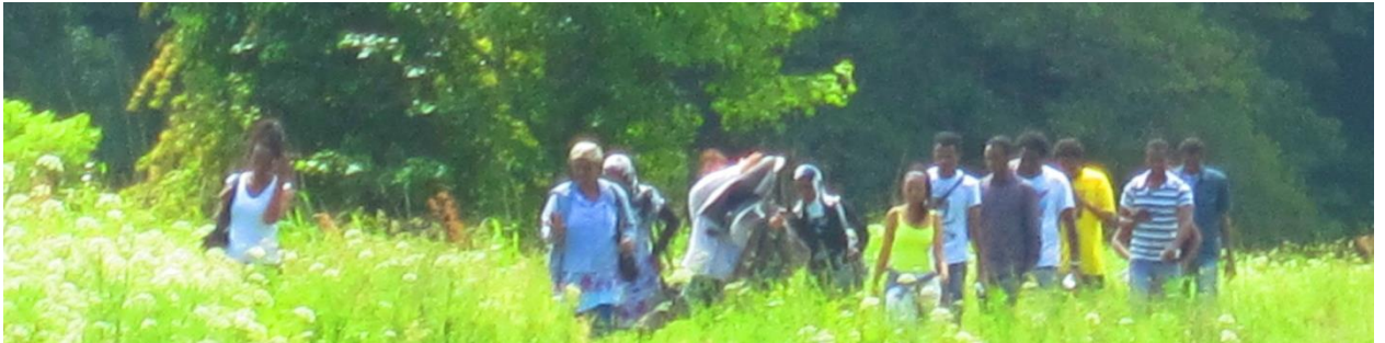
START walk - April 2014