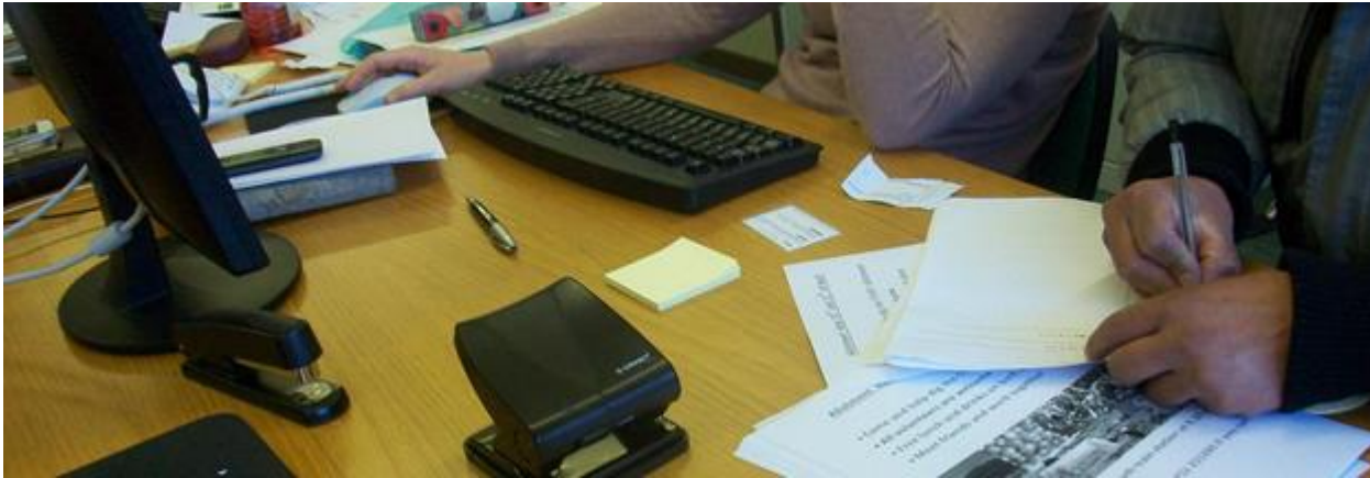
One to one support - 2014

We offer a 'one to one' casework service that addresses the issues presented by an individual. We discover an individual's aspirations and together find solutions that are tailored to them. Longer term interventions are accessed through referral. Our approach is based on a 'journey walked together' ensuring that the refugee is firmly at the centre of the support.