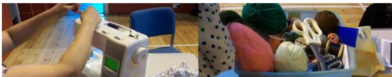
Craft workshop – February 2014

A sustainable future is more assured when we respond carefully to community needs and our strategies evolve through feedback and evaluation.