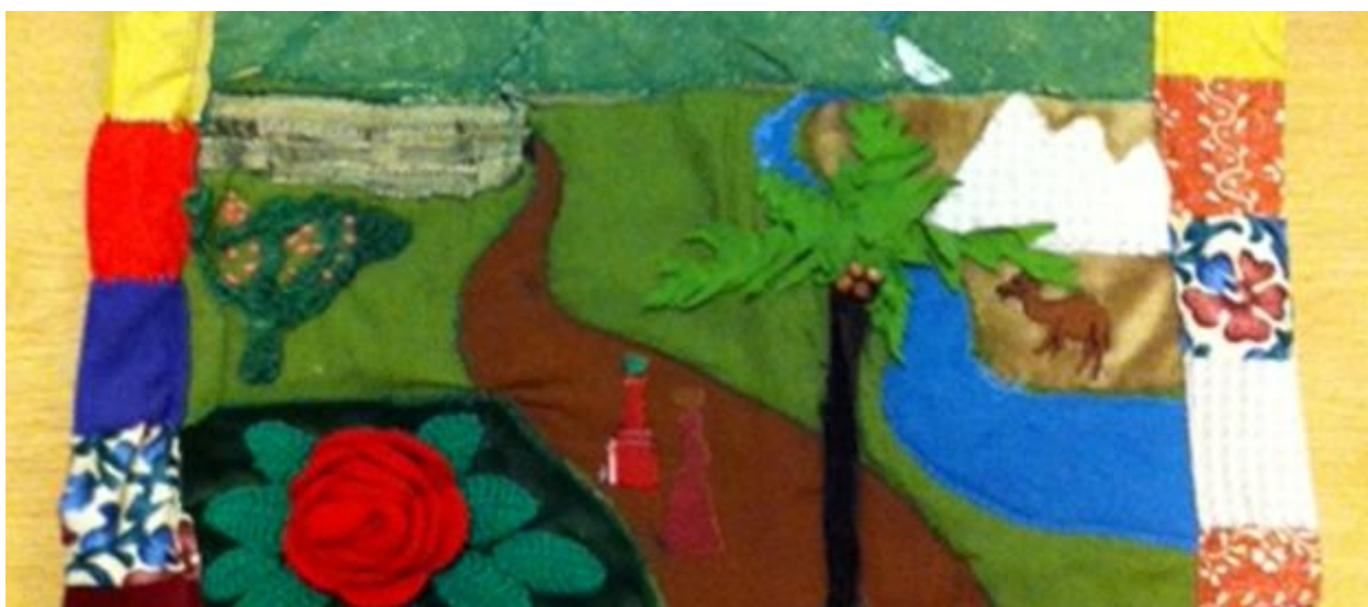
Craft project, START woman's creative group - 2014

The START women's creative group was funded this year through a grant from the Eleanor Barton Trust.